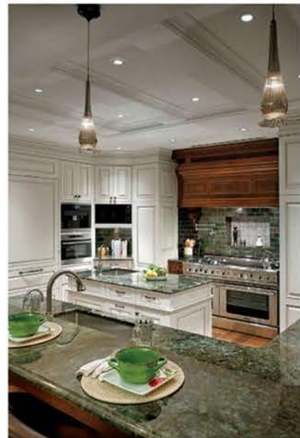
FROM TOP: The tricked-out kitchen is one of the family's favorite rooms in the house; the column-lined entryway, capped off by a painted trompe l'oeil dome, shows off the owner's climate-controlled wine room.