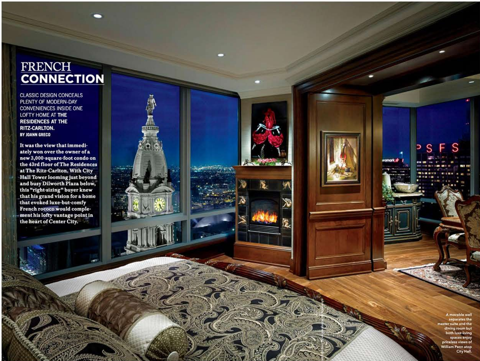
A movable wall separates the master suite and the dining room but both luxe living spaces enjoy priceless views of William Penn atop City Hall.

It was the view that immediately won over the owner of a new 3,000-square-foot condo on the 43rd floor of The Residences at The Ritz-Carlton. With City Hall Tower looming just beyond and busy Dilworth Plaza below, this “right-sizing” buyer knew that his grand vision for a home that evoked luxe-but-comfy French rococo would complement his lofty vantage point in the heart of Center City.