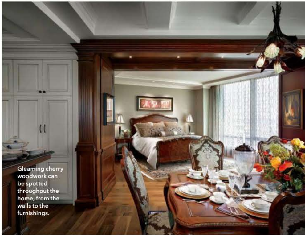
Gleaming cherry woodwork can be spotted throughout the home, from the walls to the furnishings.